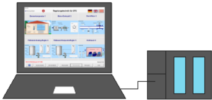
Simulation of control system on PC Controller (PLC)

Graphically monitor the transient response of the control loop on the PC.